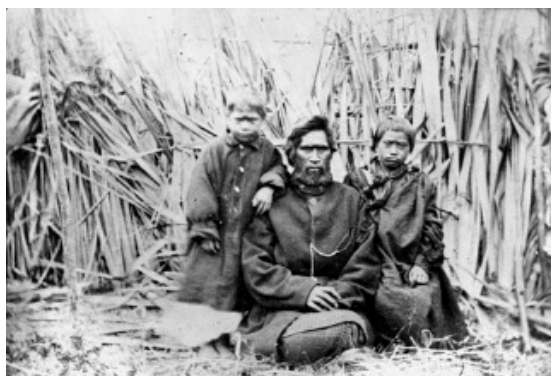
Wiremu Tamihana Tarapipipi Te Waharoa and family.

Eventually Wiremu Tāmihana became an active political voice to promote peace, justice and good faith with the government in its dealings with iwi Māori. Upon Te Waharoa's death it was evident that he had directly inherited his father's mana and became the principal Ngāti Hauā chief. During the 1850's Wiremu Tāmihana envisioned a model for peaceful co-existence between Māori and the British nation. Tāmihana became an active supportive of a unified Māori voice and with other chiefs canvassed the tribes of Aotearoa for a suitable Māori King. As a faithful Christian and ardent reader of the bible, Tāmihana drew parallels between the necessities for Māori solidarity with the biblical Hebrews' longing to be a unified nation. From this belief Tāmihana conceived of a rudimentary but visionary framework from which Māori nationalism could thrive as a distinct cultural and socio-political entity, whilst maintaining peace with the colonial newcomers.