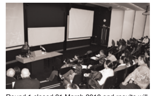
Round 1 closed 31 March 2010 and results will be notified by the end of April 2010

Round 2 opens 1 June 2010 and closes 30 June 2010