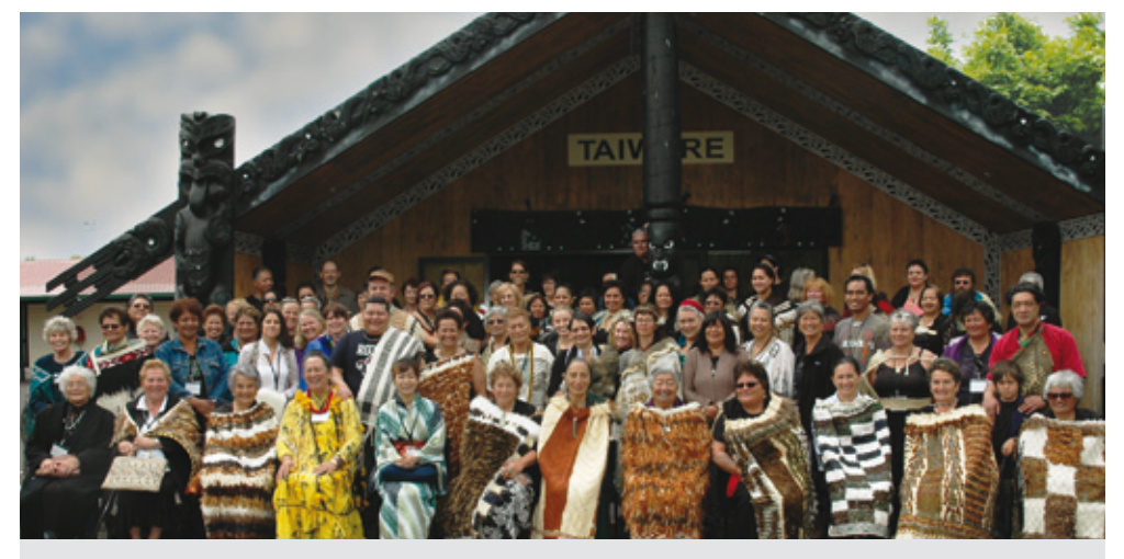
Delegates of the Indigenous Weavers International Symposium exhibit woven cloaks (see pg 5 for full article).

Seek, seek Where are you that are missing? You have gone beyond Paerau To the gathering of the treasured ones.