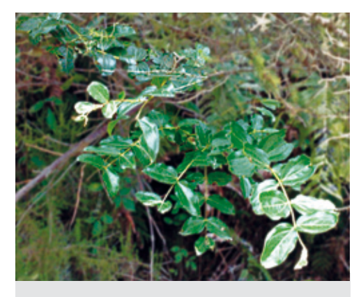
Tutu plant with toxic properties that could potentially render pest populations infertile. Story and photo provided by the researchers.

This is a potentially important area of future research and could allow the development of baits that render pest populations infertile.