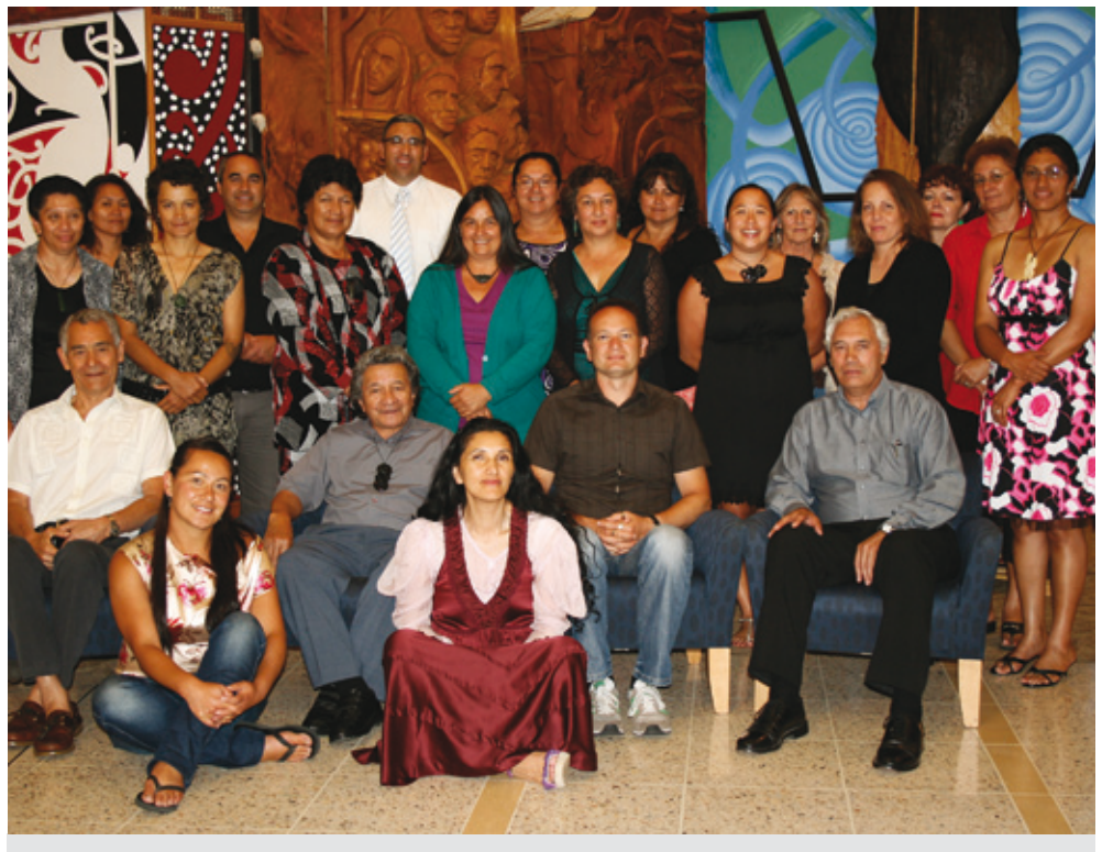
Doctoral Writing Retreat participants.

writing time and mentoring where needed. This focus is further supported by operational and recreational programmes.