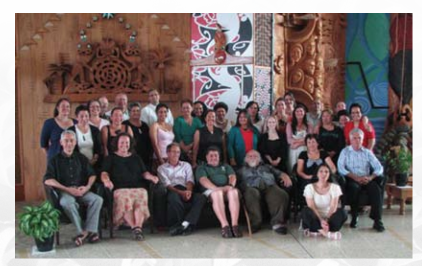
Participants of the 2009 Doctoral Writing Retreat at Hopuhopu.

The priority of the programme was to provide writing time and support for the students. It allowed the participants to