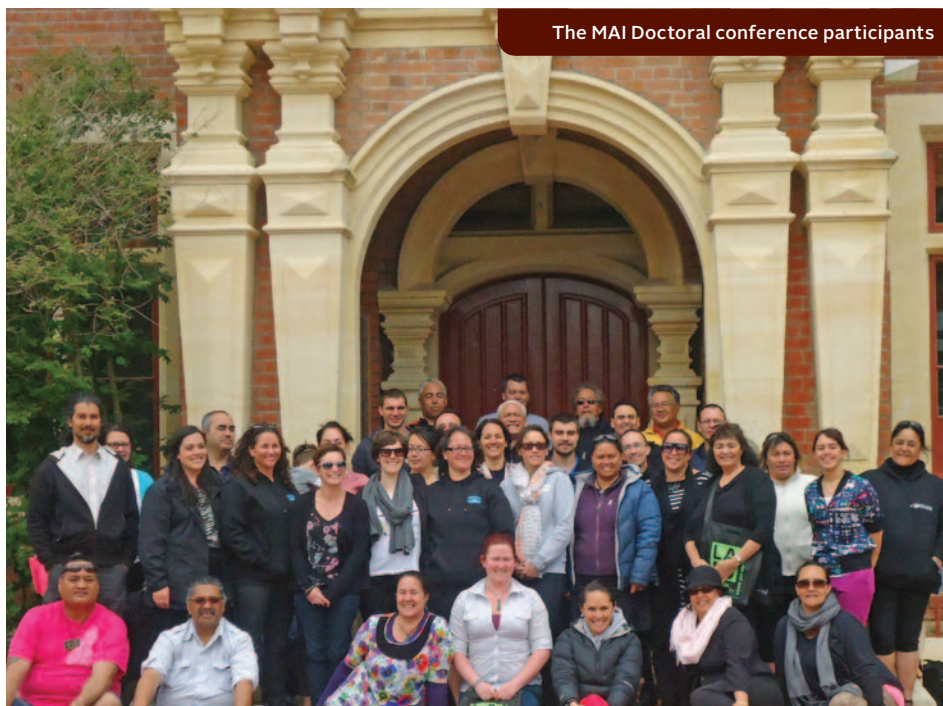
The MAI Doctoral conference participants